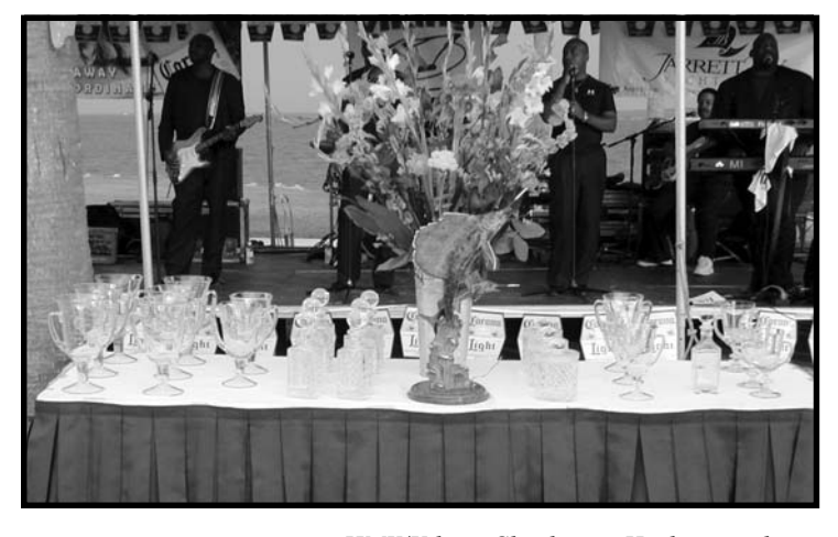
HMY/Viking Charleston Harbor trophies.