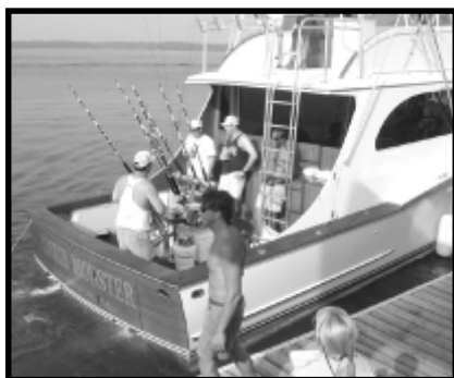
"Cookie Monster" at the docks.

lead as Lady Angler by tagging the third white of the Series. "Petrel IV" had a tag in a big blue, but ended up disqualifying themselves because the fish hit the prop during the release. Everyone's hats are off to "Petrel" for setting the standard for sportsmanship and integrity that has become a part of the SC Governors Cup Series.