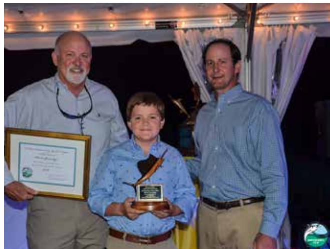
1ST PLACE YOUTH ANGLER