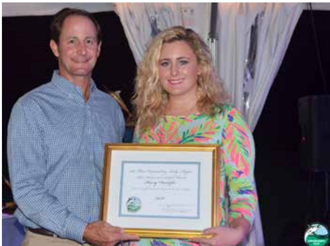
3RD PLACE LADY ANGLER