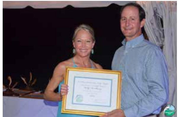
2ND PLACE LADY ANGLER