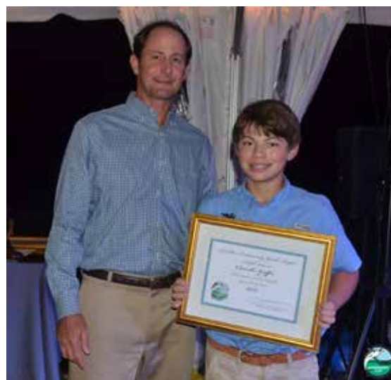
2ND PLACE YOUTH ANGLER