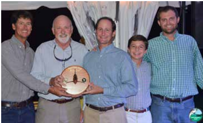
OUTSTANDING BILLFISH BOAT 3RD PLACE