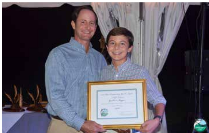
3RD PLACE YOUTH ANGLER