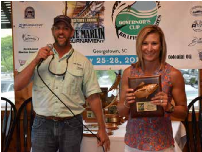
1ST PLACE LADY ANGLER