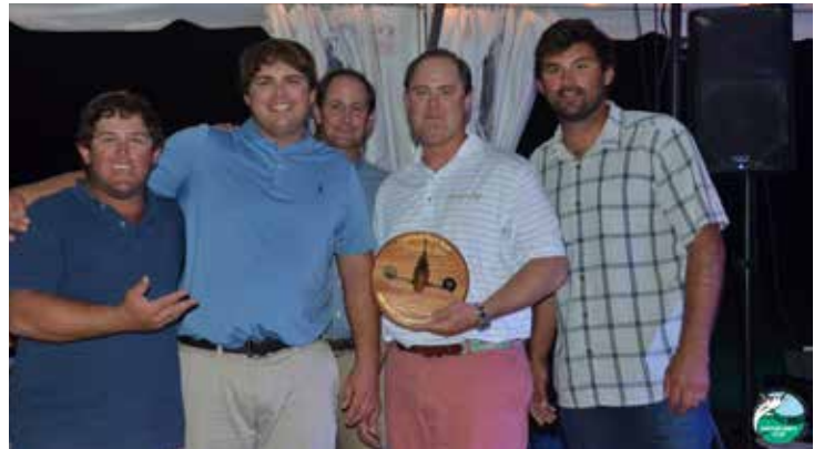
OUTSTANDING BILLFISH BOAT 2ND PLACE