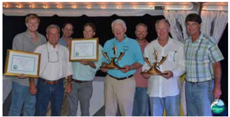
OUTSTANDING BILLFISH BOAT 1ST PLACE