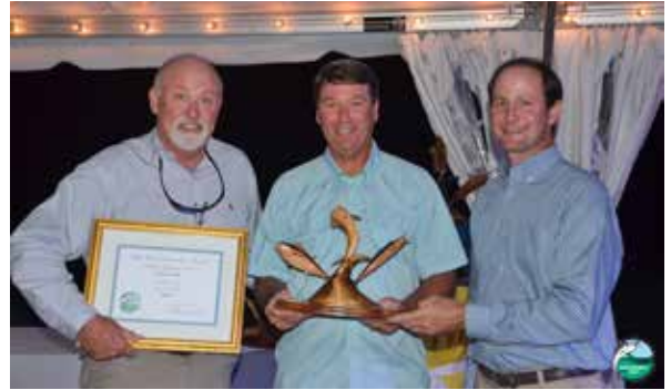
BLUE WATER CONSERVATION