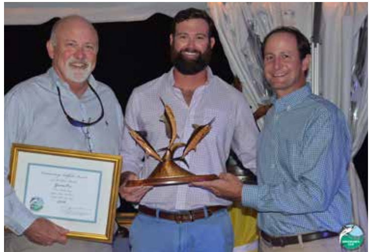
OUTSTANDING BILLFISH (LANDED)