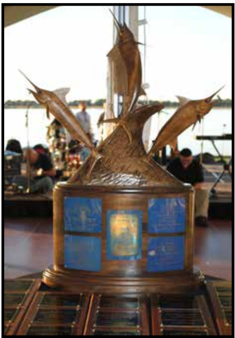
The Perpetual Trophy