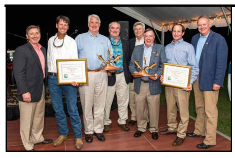
Congratulations to Rascal, winner of the 2014 Governor's Cup Series!