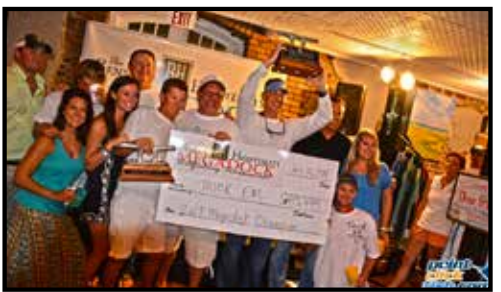
Trick 'Em takes Megadock