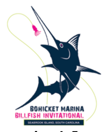
June 4 - 7