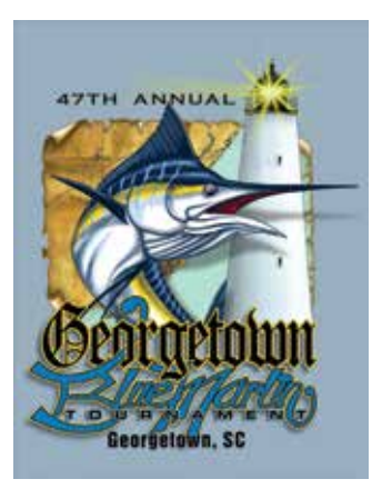
May 21 - 24