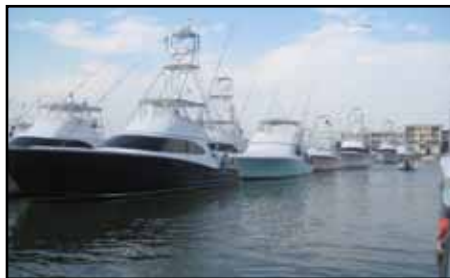
Ready to fish at Toler's Cove