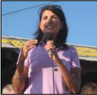
Governor Haley says a few words at the Edisto Tournament