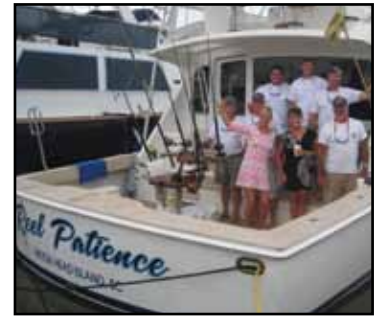
Blue Water Conservation winner, Reel Patience