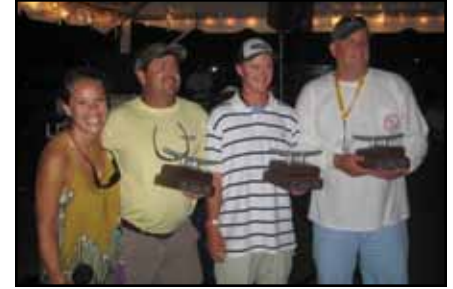
Reel Passion accepts 1st Place Billfish Boat award