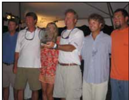
Caramba accepts 1st Place Billfish Boat award