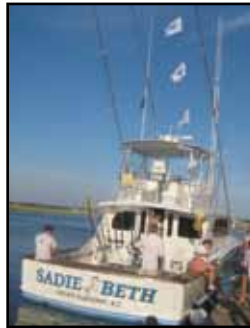
2nd Place Boat Sadie Beth returns from fishing with flags flying

A total of 20 boats participated in the tournament, and 54 billfish were caught and released, including 53 Sailfish and 1 Blue Marlin. "Fishing was excellent, with billfish release numbers up 35% over the previous year even though the number of participating boats declined by 30%", said SCDNR biologist Amy Dukes.