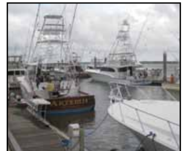
Boats lined up on the MEGADOCK