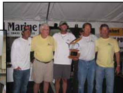
The Sportin' Life crew celebrates their come from behind Georgetown victory!