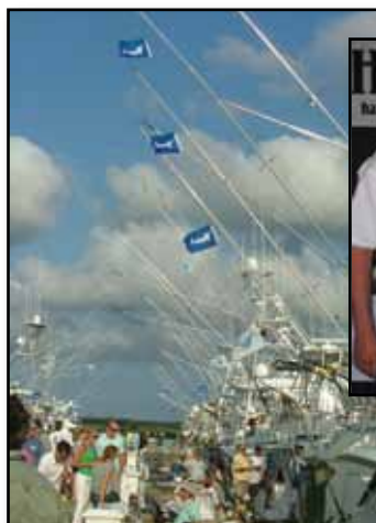
Lot's of flags flying! Eric Heiden