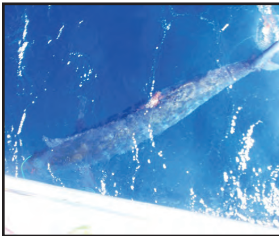
Blue Marlin release.