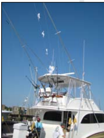
"Micabe" flying 5 sailfish release flags on Friday of the MEGADOCK Tournament.