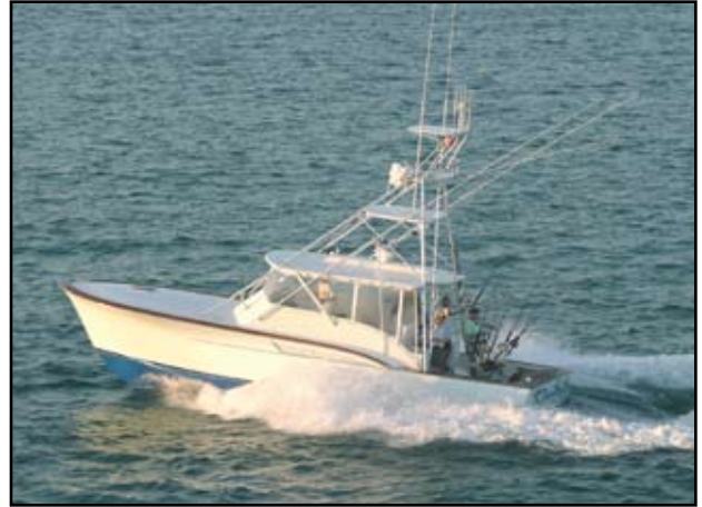
Sister ship of boat under construction.

Call us now to discuss making this complete package of performance, luxury, convenience and quality uniquely yours. 252.728.2690 ~ info@JarrettBay.com .