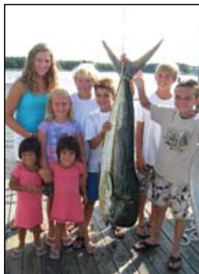
Kids at MEGADOCK enjoyed seeing the landed fish.