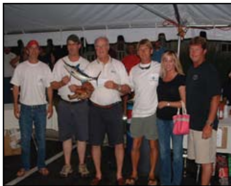
The crew from the "El Tejano" accept their award for Outstanding Billfish Boat at the Georgetown Blue Marlin Tournament.

participated in the tournament with 23 billfish releases including 12 blue marlin, 9 white marlin and 2 sailfish. No billfish were landed.