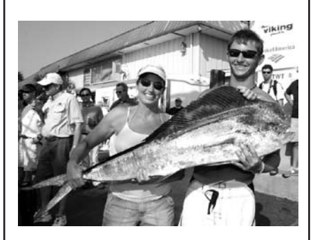
"A lot of bull"

The 18 boats that went out on Day One saw plenty of fish. One blue and 9 sails were caught. One of the sails was released with a satellite tag. "Syked Out", "My Time Out" and "Rookie IV" came back with double headers in