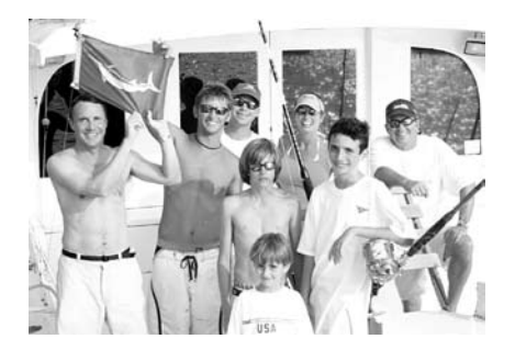
One of many at the MegaDock.

the sailfish category. "My Three Sons" released a blue and "Caramba", "High Maintenance", "Hot Rod Blue" each released sails.