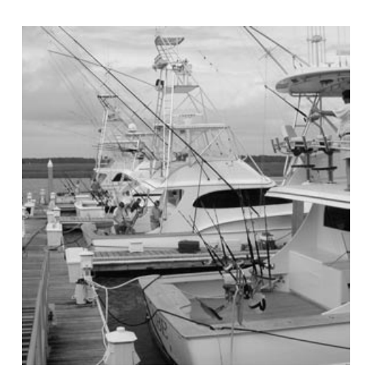
REMEMBERING LAST YEAR